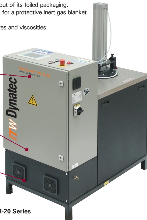
Dynamelt™ PUR-20 Series

Integrated adhesive reservoir eliminates the need to shut down the system when changing bags.