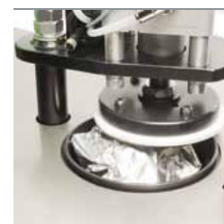
Platen assembly above feed tube