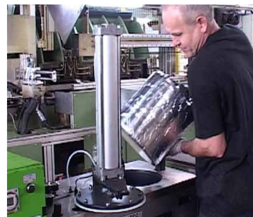
Inserting a new bag or "slug" of adhesive into the melt unit