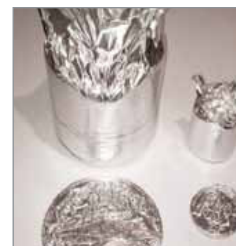
Full and "spent" adhesive bags